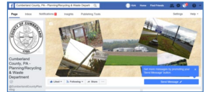
CCPC Facebook Page